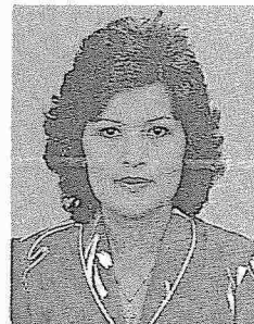
Biodata of Writer

Tunku Noraidah T.A. Rahman, 1984. Negeri Sembilan: A Preliminary Bibliography . Kuala Lumpur: Perpustakaan University Malaya.